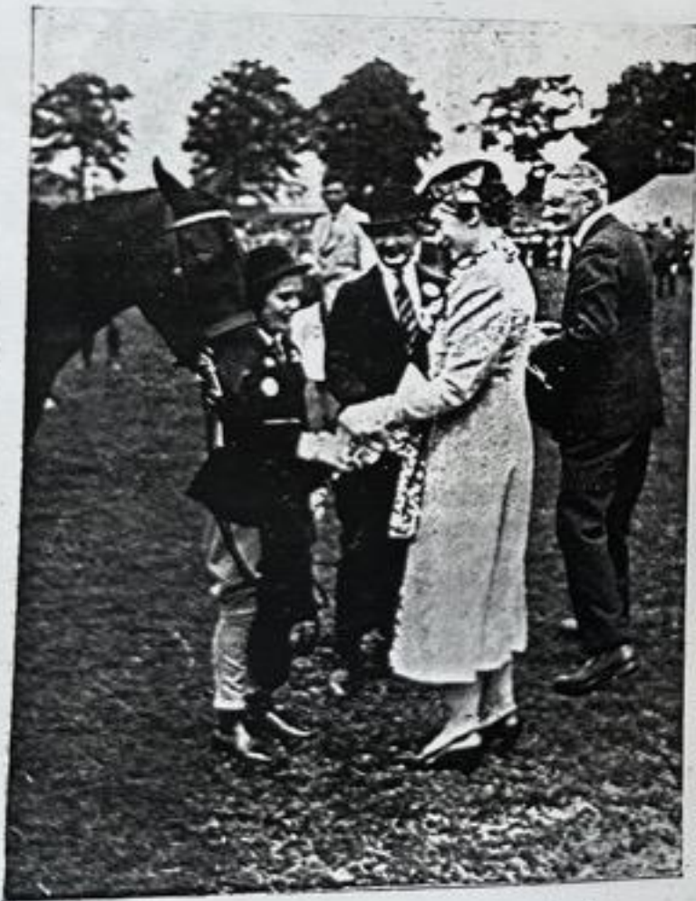
H.R.H. Duchess of Gloucester presenting prize to a pupil.

The school also undertakes to break, train, and improve young, difficult and fractious horses. Re-mouthing a speciality.