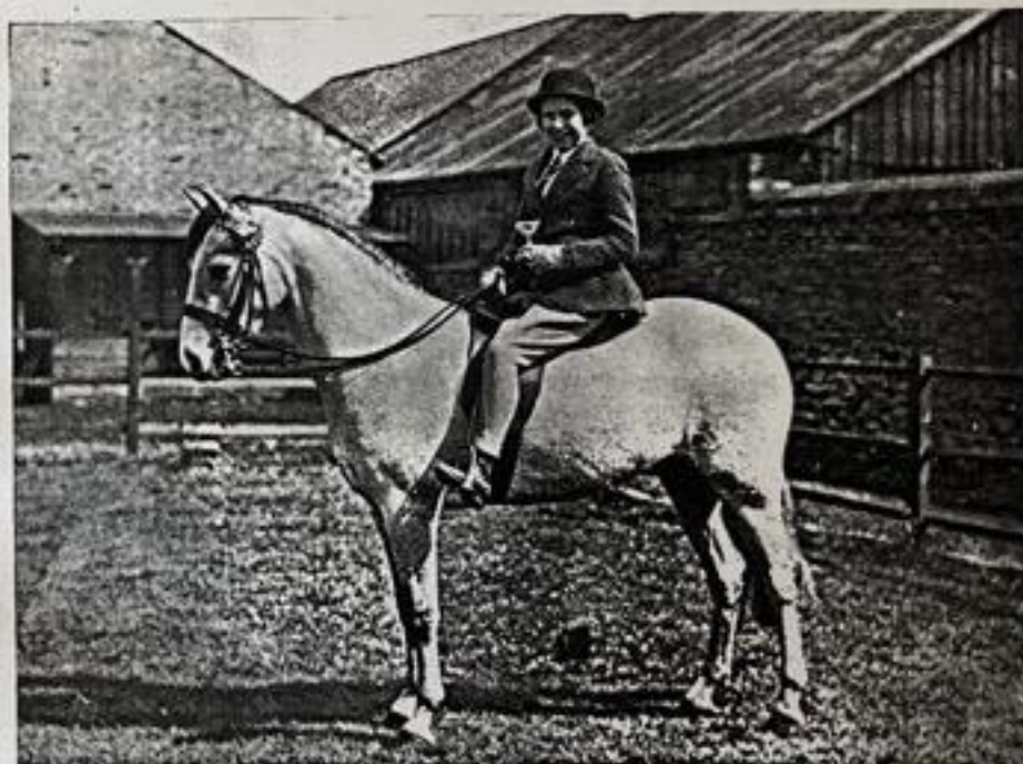
Pupil Winner of Cup for best child under twelve at the St. George's Horse Show.

Good reliable hacks, and children's ponies are always available for hire.