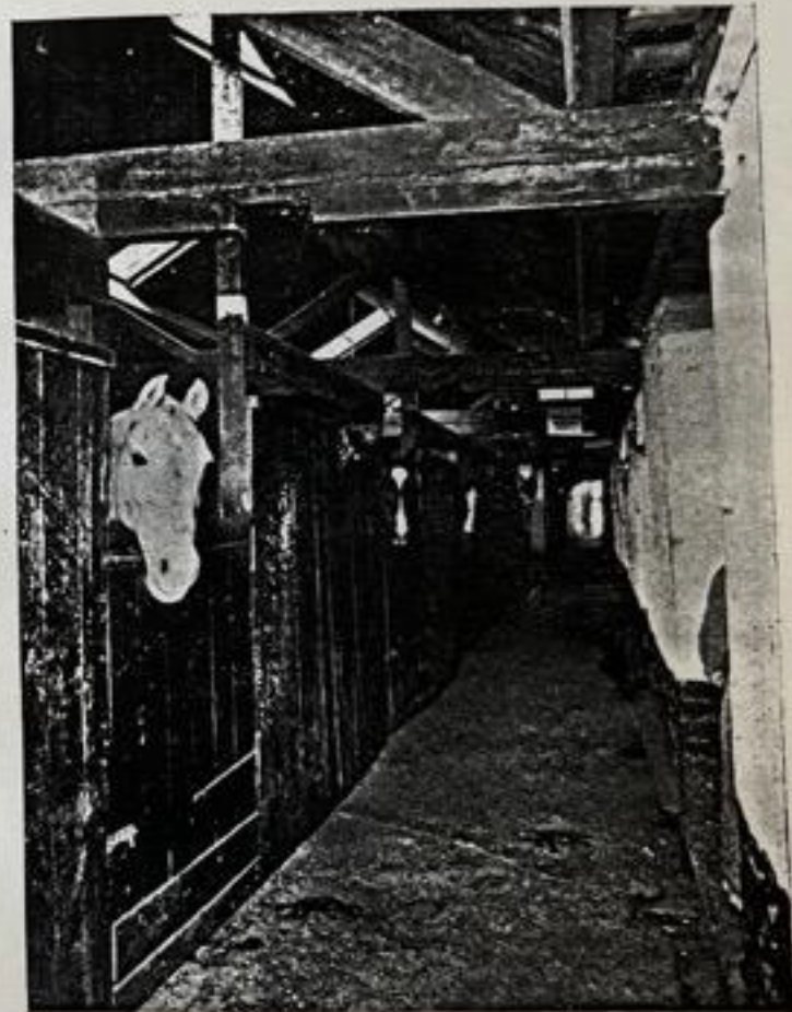
A View of the well-conditioned Stables.

Horses taken at livery at reasonable rates, and given that personal care and individual attention so necessary to their well-being and appearance. There are good roomy loose boxes, abundance of forage, good bedding and ample water.